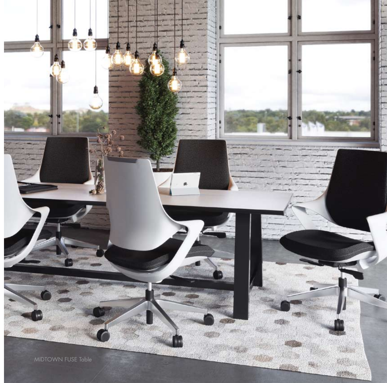
MIDTOWN FUSE Table