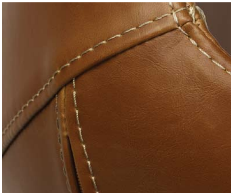
Look and feel of hand stitched leather