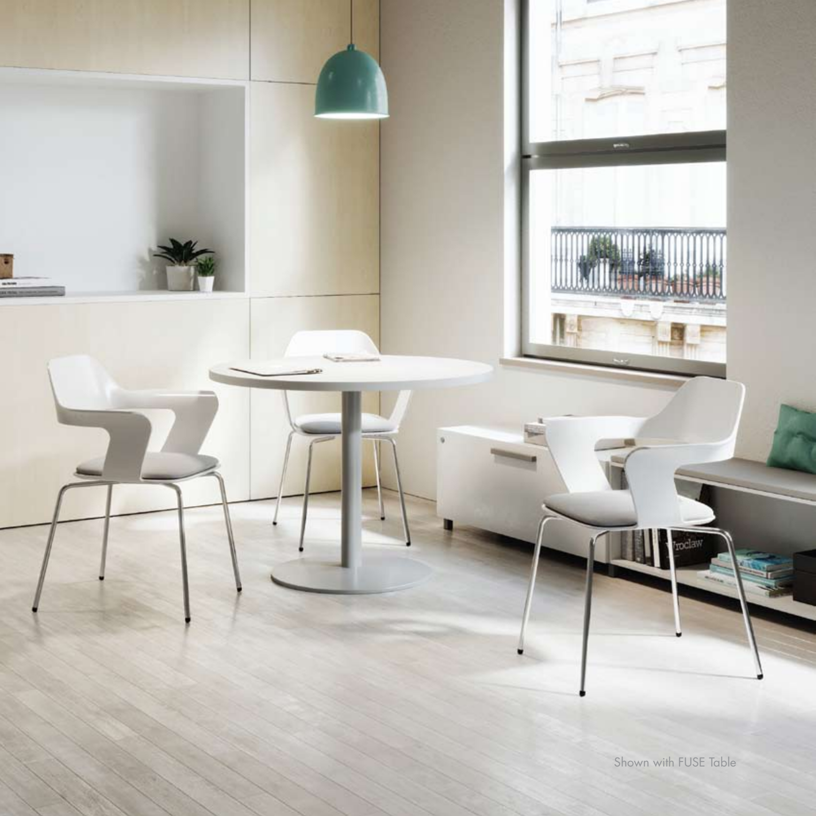
Shown with FUSE Table