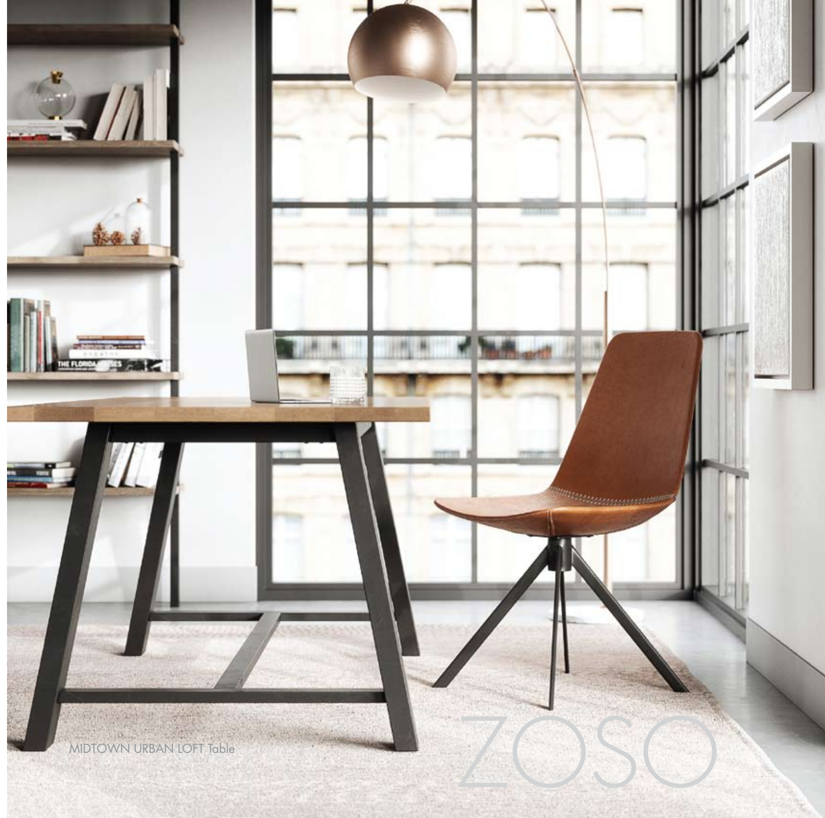
MIDTOWN URBAN LOFT Table