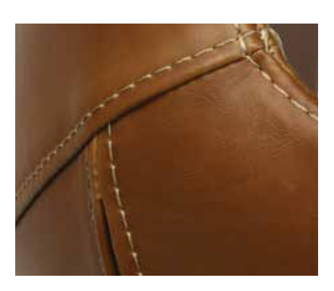
ZOSO Designed by KFI Studios

With the look and feel of hand stitched leather, Zoso adds a touch of modern sophistication.