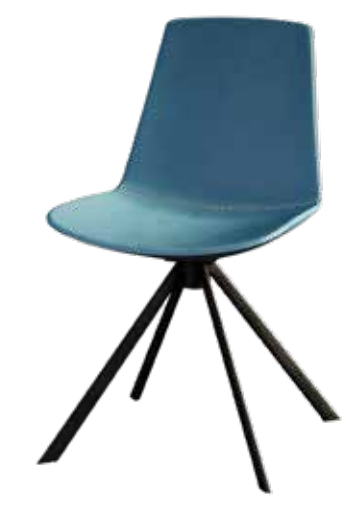
Café and Stool • Four colors • Swivels

With the look and feel of hand stitched leather, Zoso adds a touch of modern sophistication.