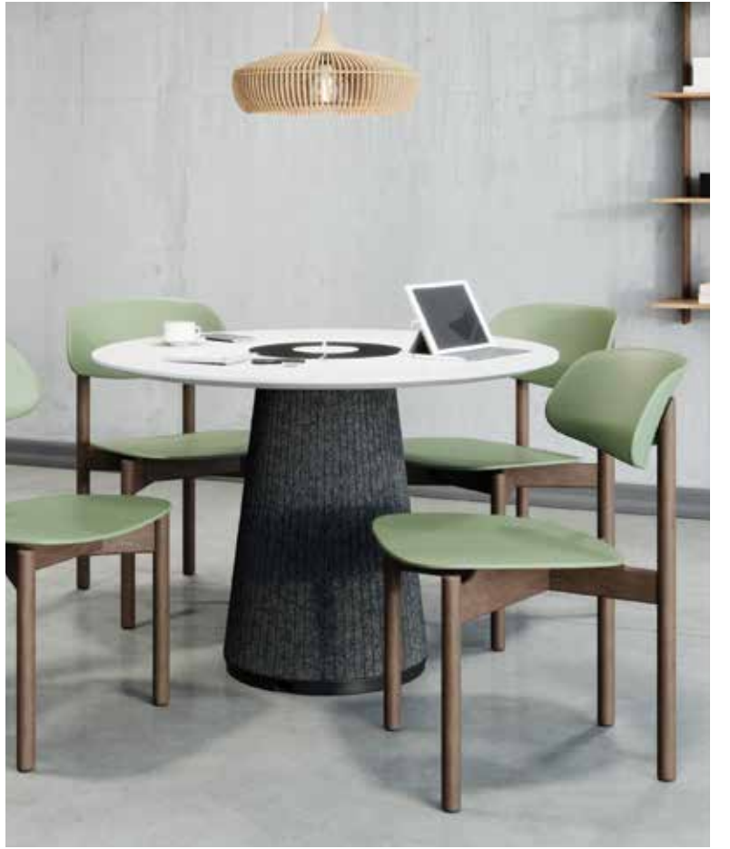
Light or Dark woodstain • 6 Poly colors

Minimalistic design. The seat and back appear to be suspended effortlessly atop the frame.