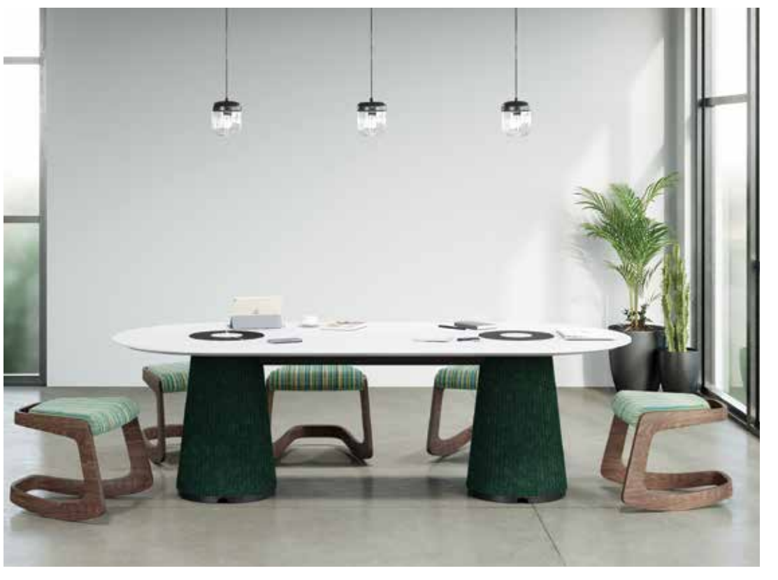
Two wood finishes • Your upholstery choice