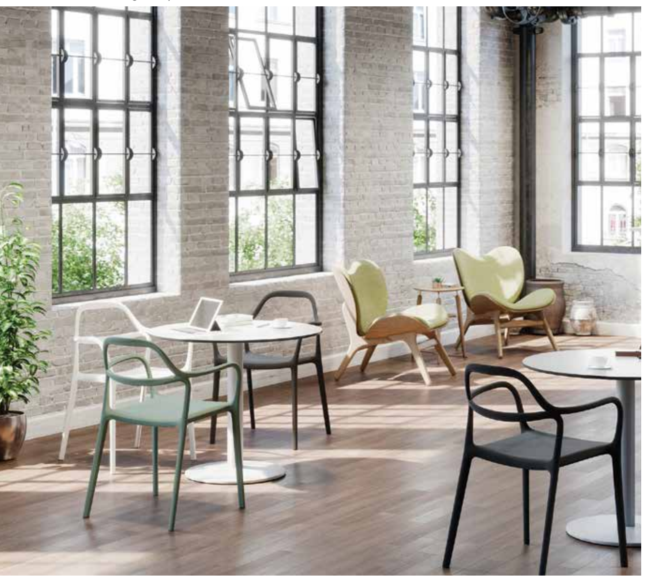
Swaying curves with smooth flowy lines, light weight, and sleek details, give it a uniquely expressive silhouette.