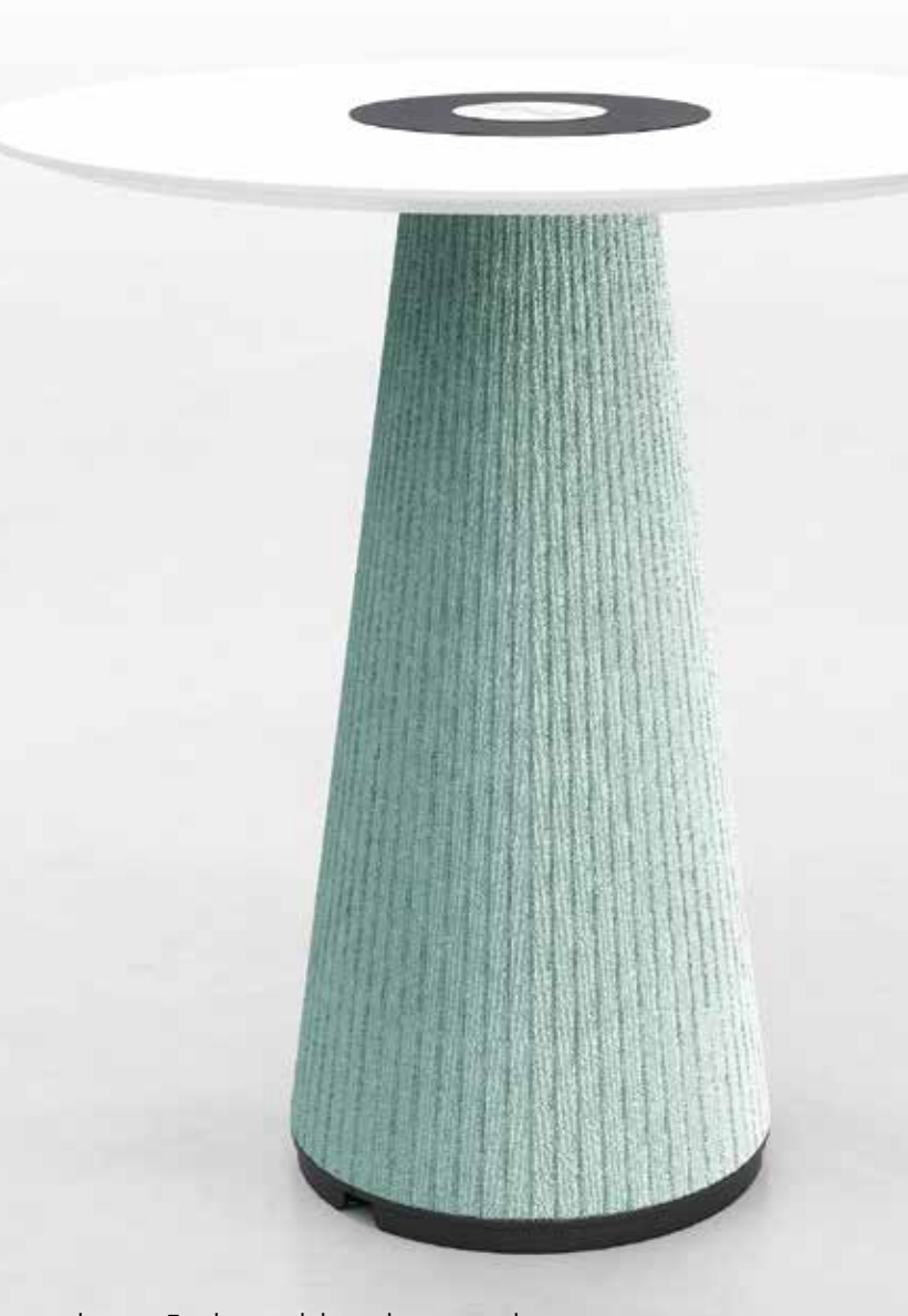
Three heights • 7 PET base colors • Easily wired through center column

Clean lines compliment a variety of aesthetics. The center column is easily wired with your choice of power options.