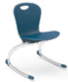
ZUMA® Series Rocking Chair