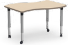
5000 Series Slide Activity Table