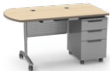
Textameter™ Series Instructor Desk