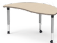
5000 Series Nest Activity Table