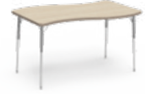
4000 Series Slide Activity Table