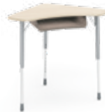
ZUMA® Series ZBOOM Desk