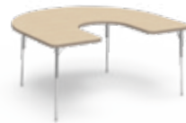
4000 Series Horseshoe Activity Table